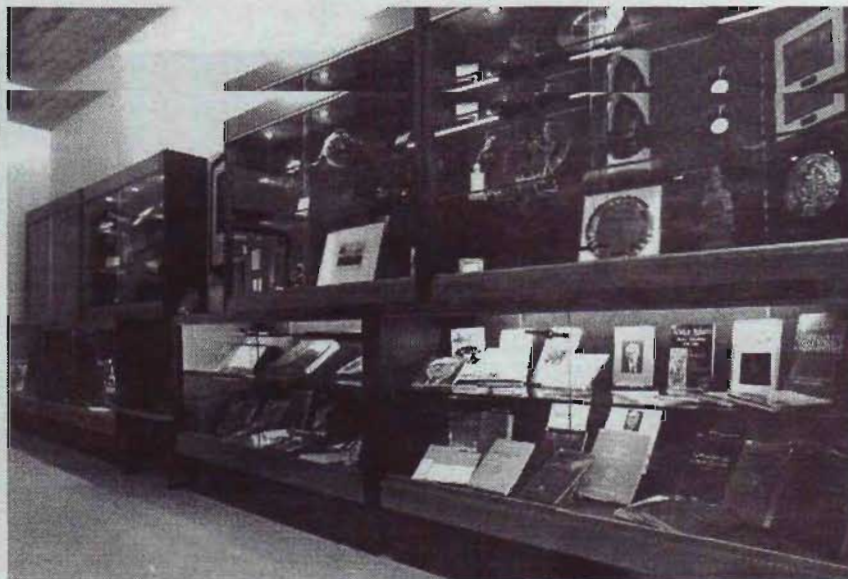
Showcase of prizes, awards, and presentations gained by ICTP President Abdus Salam, who has donated his collection to the Library.

Also included in this display are the books authored by Abdus Salam, in all editions and languages. The walls of an ante-room off the reference section of the Library, just beyond the showcase, are decorated with just some of the many diplomas gained by Salam, who has also donated his own book collection to the Library. A full set of Salam's collection of research papers, bound in 16 volumes, is also held in the Library. A further precious item is a file of correspondence between Wolfgang Pauli and Abdus Salam, mainly from the 1950s.