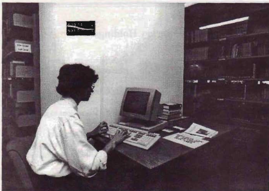
Five workstations for consultation are available in the Library.