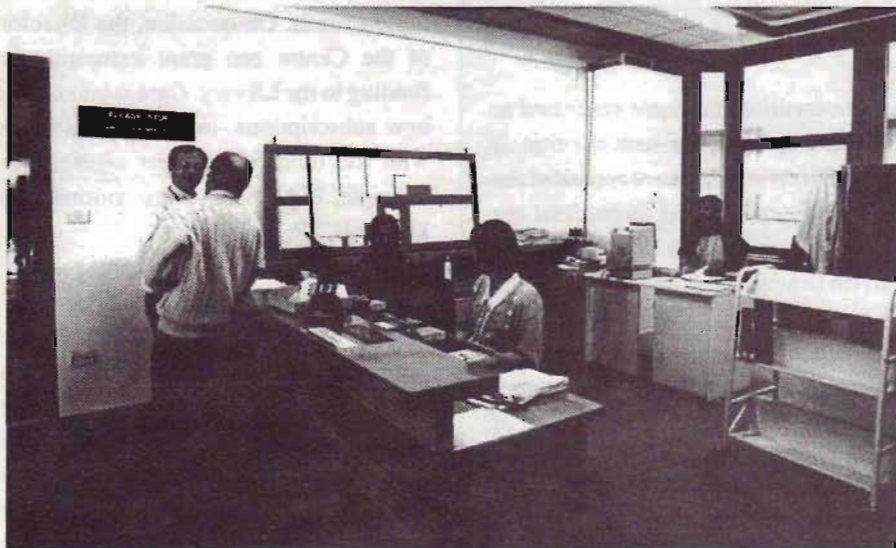
The Loan Desk.