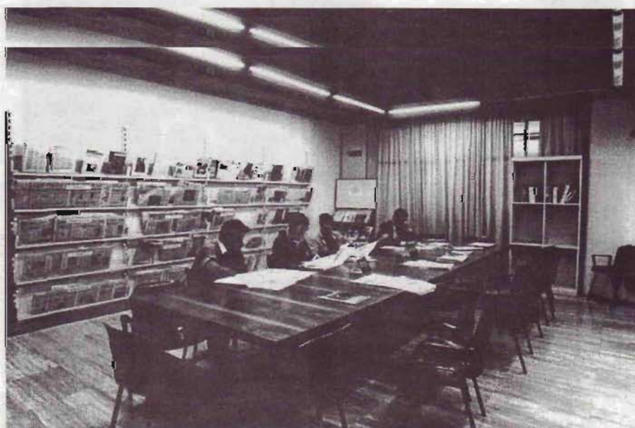
Reading room for general reading.

Journal subscriptions are considered once a year in the Autumn, to allow sufficient time for the subscription to start up the next year. A number of factors need evaluating, including costs: journal