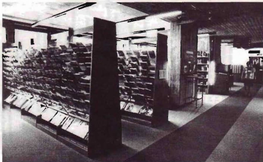
The periodicals display.

work is maintained, going back four years, plus around 12,000 received annually from institutions worldwide.