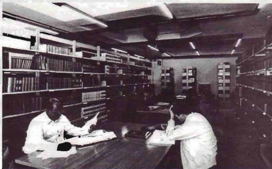
Interior of ICTP Library: fireproof carpeting throughout and a sprinkler system ensure maximum protection against fire hazard.

Let us take a look at the services available.