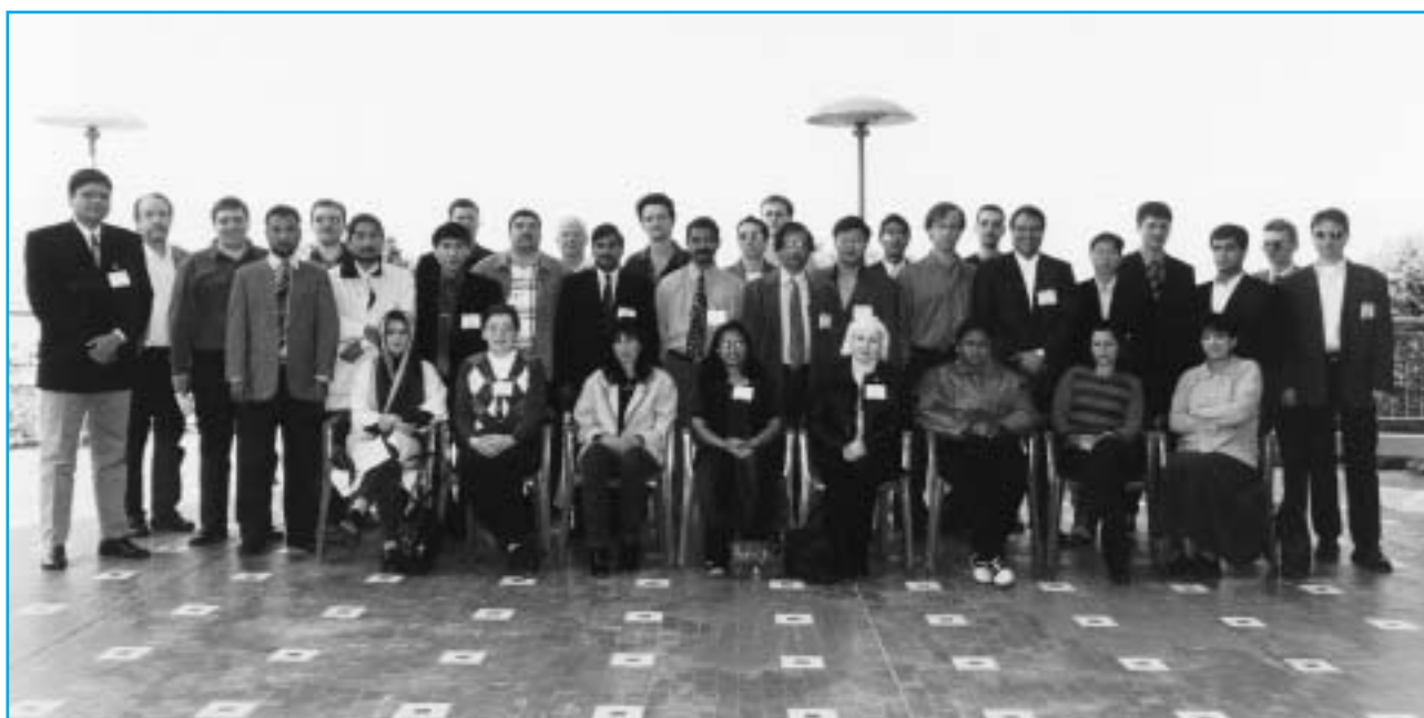
Workshop on Nuclear Reaction Data and Nuclear Reactors: Physics, Design and Safety

The Workshop is a unique international forum in which scientists and engineers receive up-to-date information on the 'know-how' behind nuclear reactor calculations. The Workshop aims to train scientists and engineers from developing and developed countries in nuclear reaction theory, data production and use. Particular emphasis was placed on applications in nuclear reactor physics, design and safety. Participants were familiarised with the use of modern computer codes relevant to these topics as well as with the applications of rapidly advancing information technology for retrieval of nuclear data. Participants also examined new trends in advanced nuclear systems for energy generation.