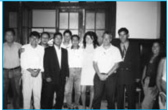
Participants in Advanced Course on System Simulation and Hardware Synthesis Using VHDL

The Course introduced Latin American scientists and engineers to the most up-to-date efforts in the design and simulation of large computer systems using VHDL, a hardware description language. Taught in Spanish, the Course consisted of 16 hours of theory and 40 hours of assisted laboratory work, with an additional 64 hours of independent design exercises. Discussions and laboratory work concentrated on programming and simulation using VHDL and the design cycle, including implementation of designs using FPGAs and standard cells.