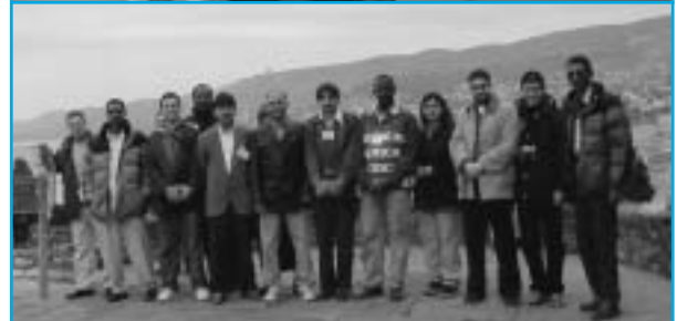
Long distance link between Galileo Guesthouse and downtown Trieste