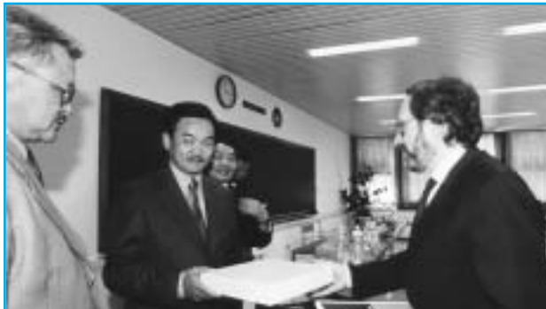
Natsagyn Bagabandi, President of Mongolia, at ICTP in 2000

notes, "would bring both ICTP's and Mongolia's scientific community one step nearer their shared goal: To create a self-sustaining community of homegrown scholars with the knowledge and experience necessary to interact with like-minded colleagues from around the world." □